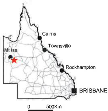
QUEENSLAND INDEX MAP