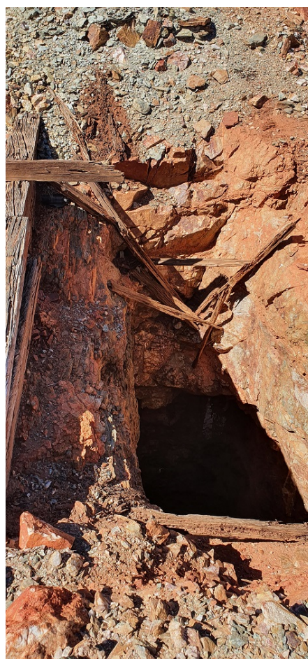
Photos 1 & 2: Examples of trenches and a shaft from Cracker Jack project (P20/2289), indicating the targeting of epigenetic gold mineralisation over a ~300m zone.